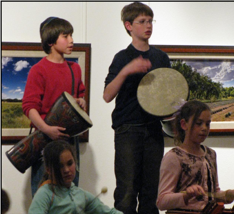
Student Performance Night

A wonderful time for the whole family, lots of free activities for the kids!